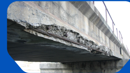
Oil & Gas Support Roles