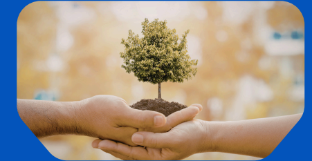
Corporate & Administration