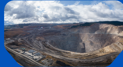
Retail & Hypermarkets