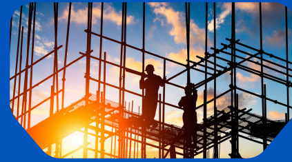
Construction & Infrastructure