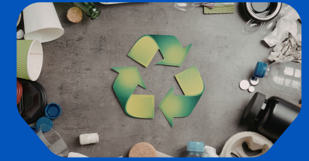
Engineering & Technical Services